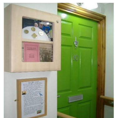
Thanks to Wren Hall and Landermeads in Nottinghamshire, UK